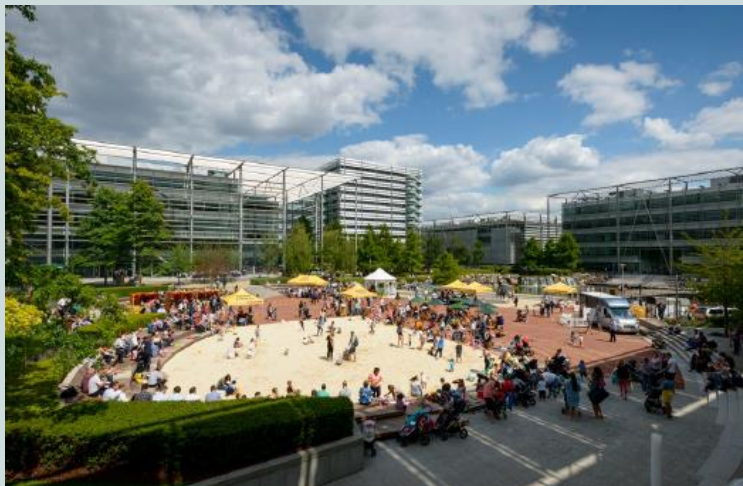
Chiswick Park Community