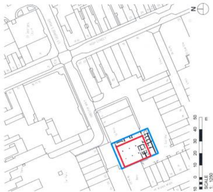
2 SITE PLAN GROUND FLOOR RETAIL STORE

For identification purposes only – not to scale.