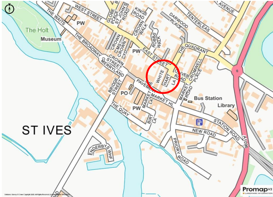
St Ives (Cambridgeshire)