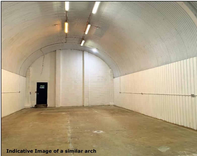
Indicative Image of a similar arch