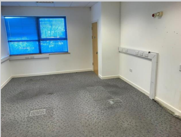
Ground floor rear

The premises comprise the ground floor of a two-storey, office unit constructed in 2006 within a terrace of four similar units. The high quality, accommodation is mainly open plan with partitioning forming offices and a meeting room and store.