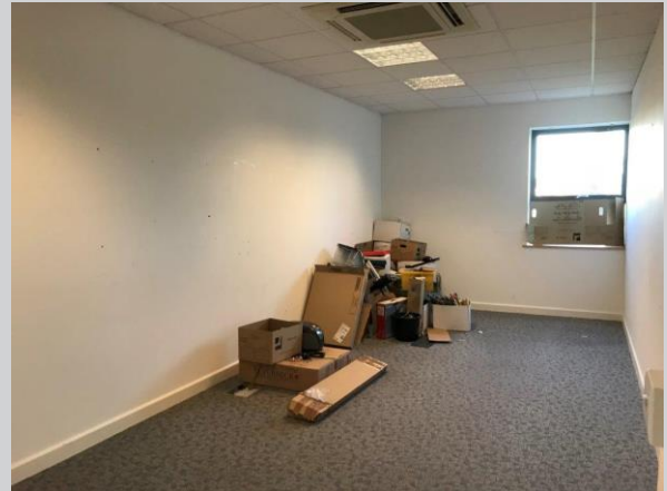
Ground floor rear office