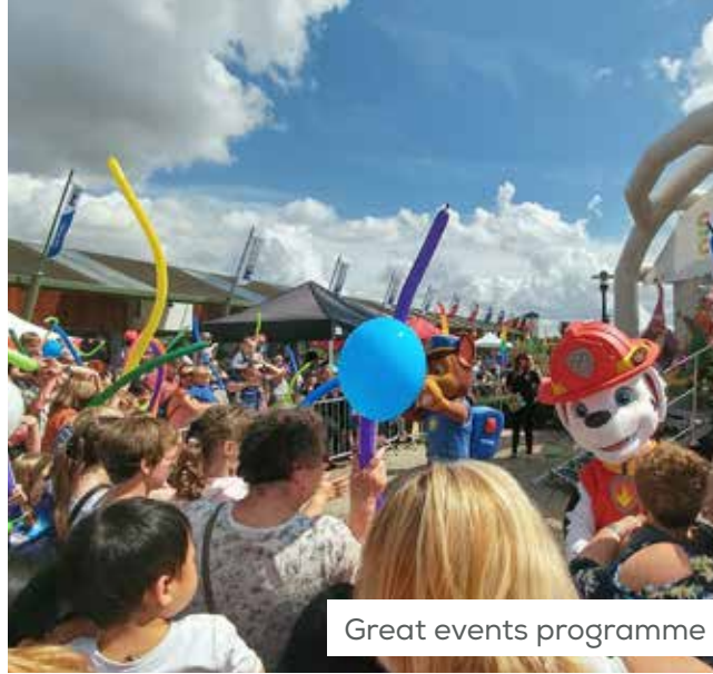
Great events programme