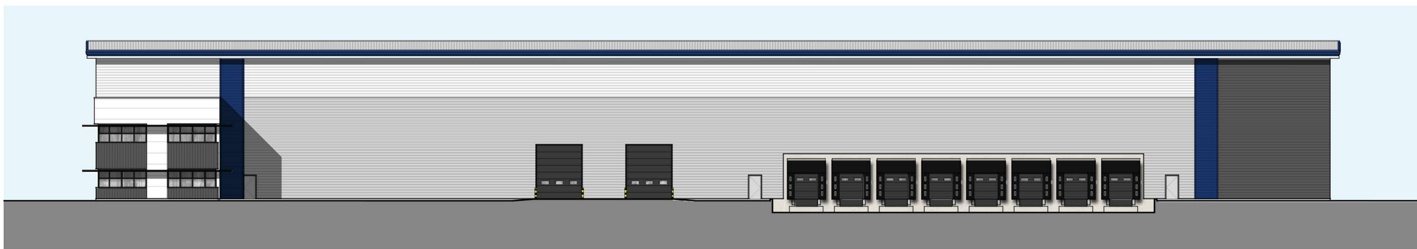
South West Elevation - Scale 1:200