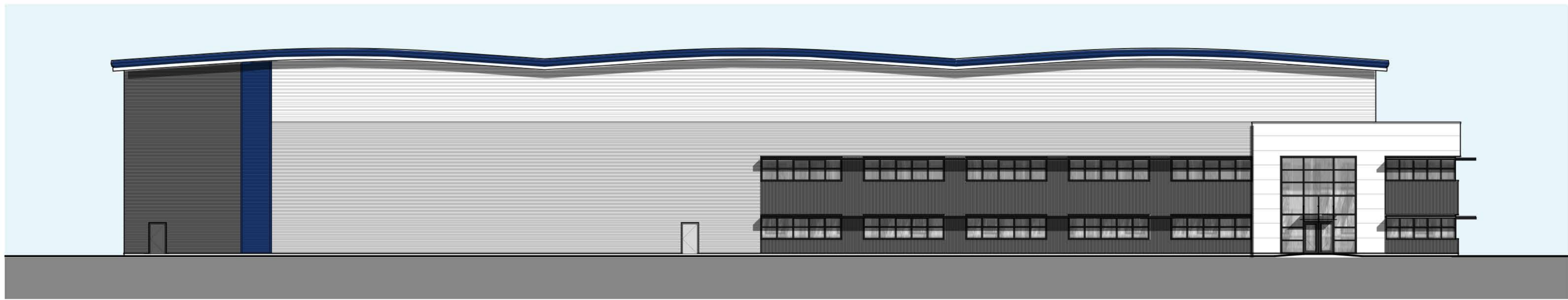
North West Elevation - Scale 1:200