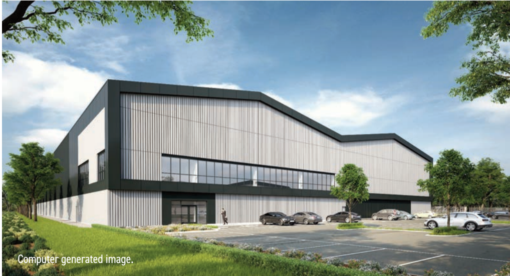
Computer generated image.