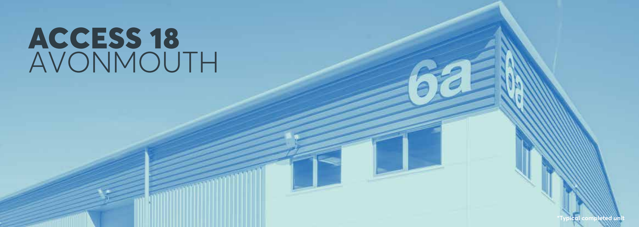
*Typical completed unit