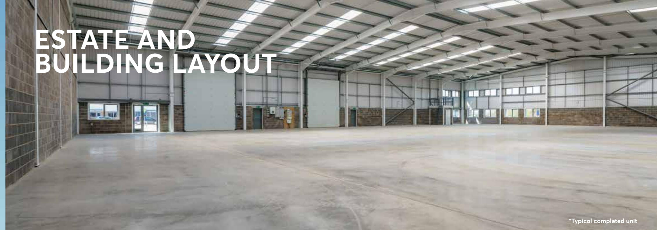
*Typical completed unit