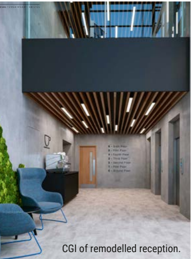
CGI of remodelled reception.