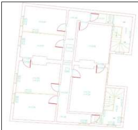
Indicative 1 st Floor Plan