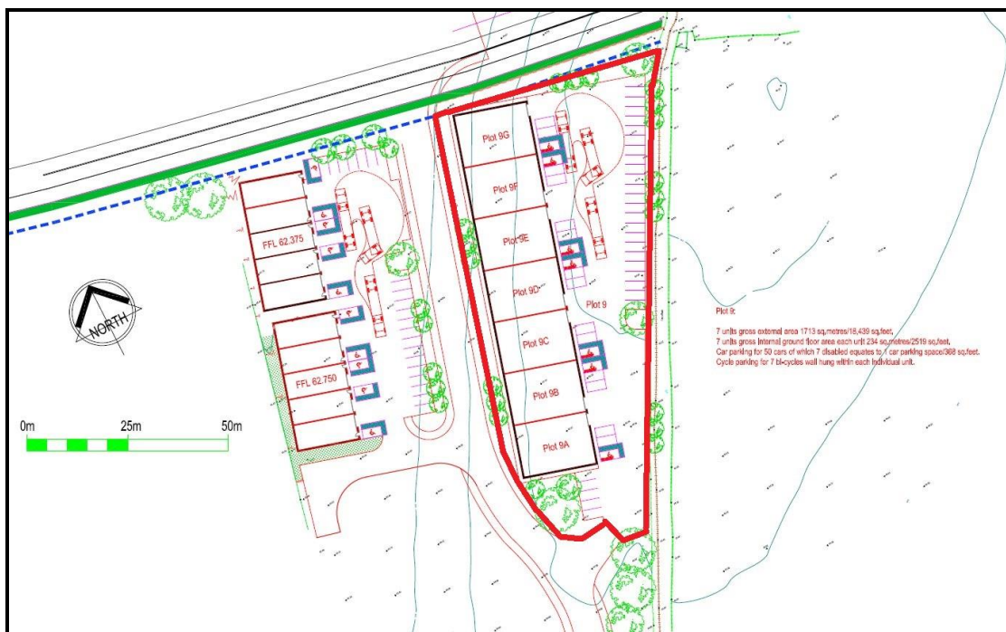
PROPOSED UNIT LAYOUT

Tel: 01392 874209 Web: www.peppercommercial.co.uk Unit 5 Clyst Court, Hill Barton Business Park, Exeter EX5 1SA