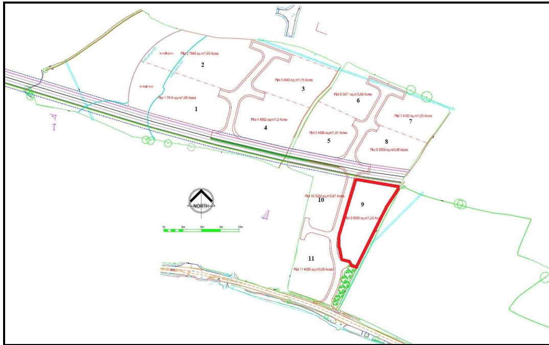
PROPOSED SITE LAYOUT