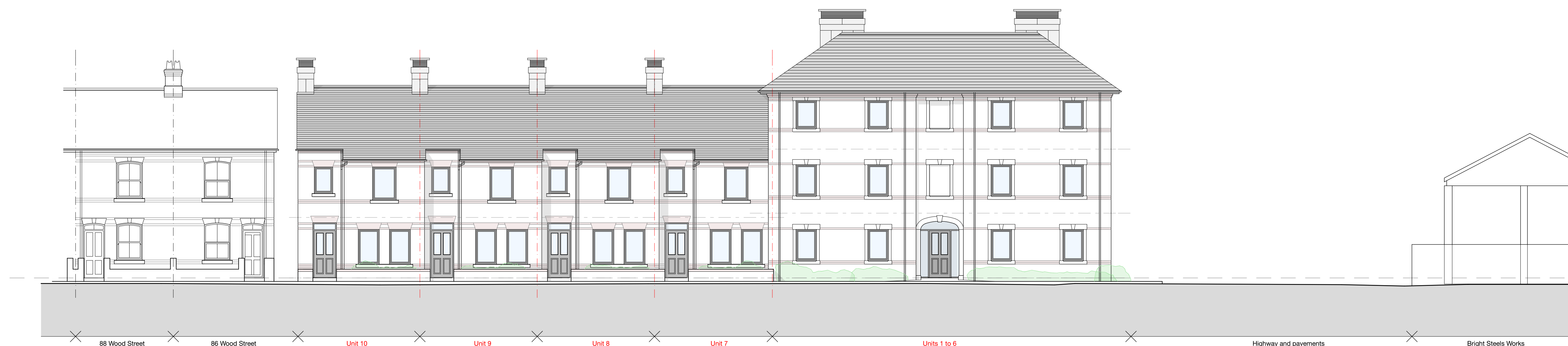
North Elevation Development and streetscene