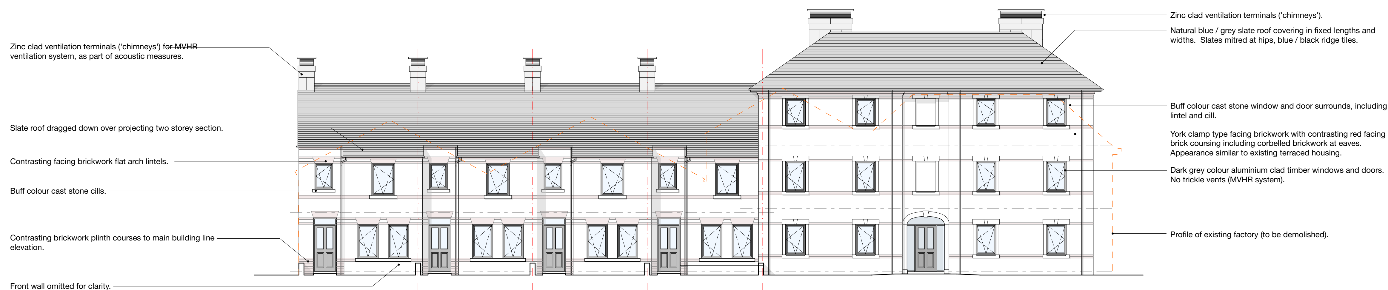
North Elevation Development only